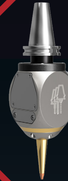
AMBIT TM FLEX LASE

For best results, Hybrid recommends the use of a pulsed laser for percussion drilling or trepanning to make precision holes