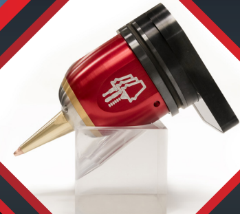
AMBIT TM MULTI LASE on a stand