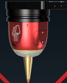
AMBIT TM MULTI LASE