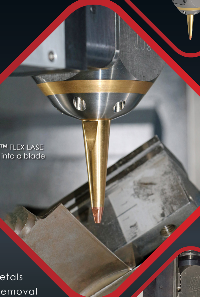
AMBIT TM FLEX LASE drilling into a blade